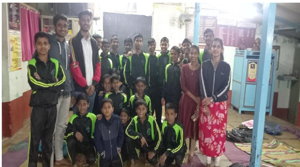
Student teachers with students of Shahu Boarding