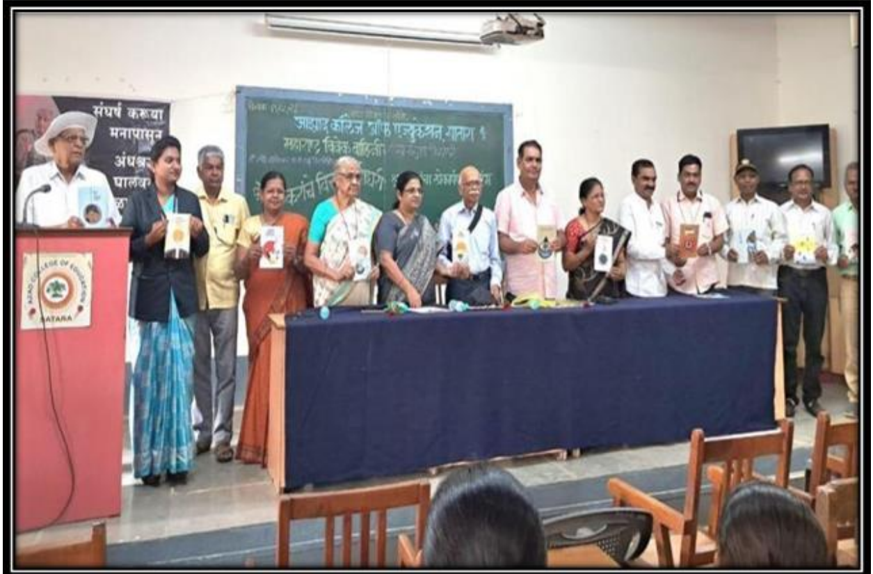
Dabholkaranche Vichar Gharoghari Program Book Publication