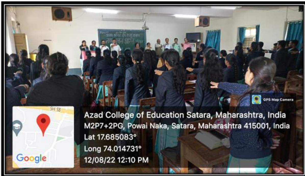
Pledge by Student Teacher on Nasha Mukta Bharat Workshop