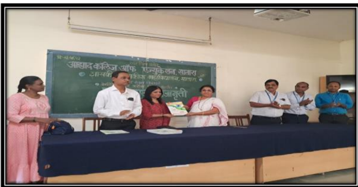
Organ Donation Awareness Workshop Felicitation