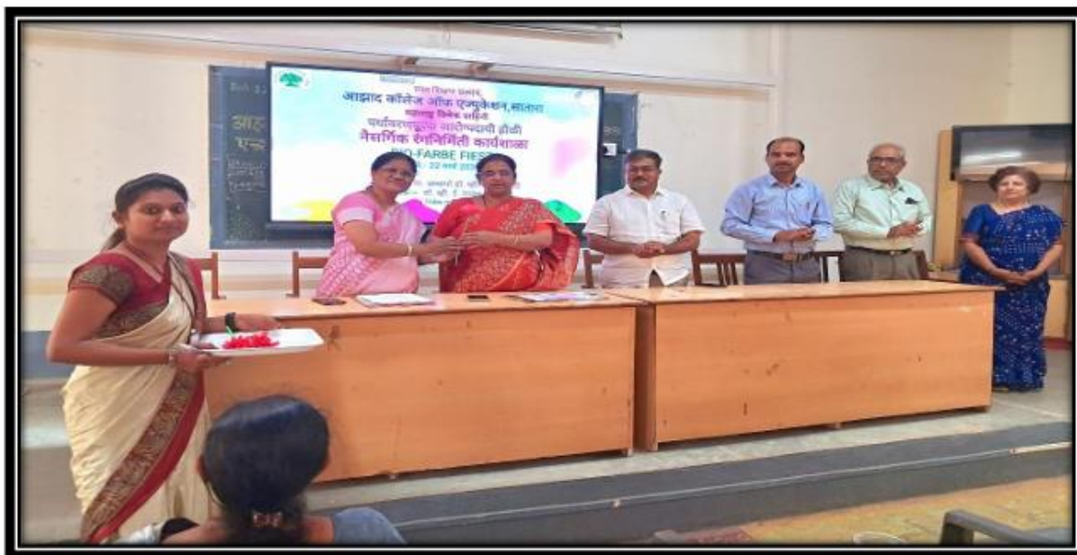
Natural Organic Colour making workshop Felicitation